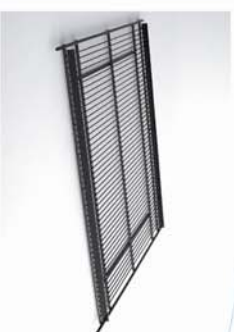
Product Stop Front and Rear