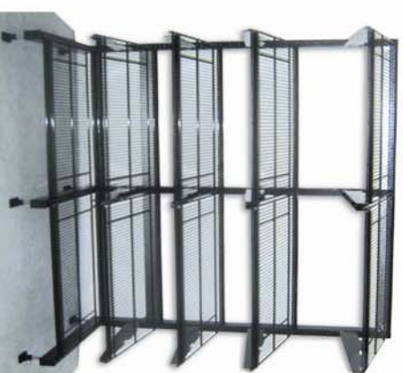
Cantilever Shelving System