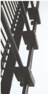
Joiner Block with Divider Rods