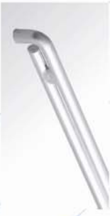
Side Product Stop/ Spreader Bar