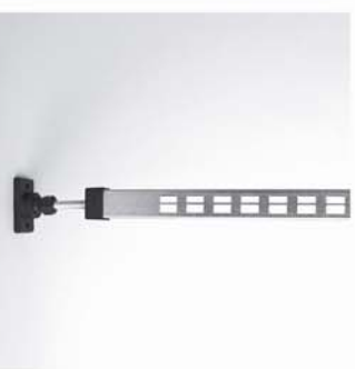
Adjustable Post Feet