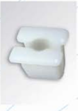
Side Stop Locking