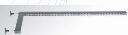
Cantilever Post & Feet