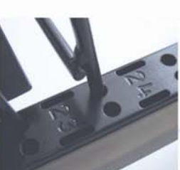
Numbered Shelf Post for ease of merchandising