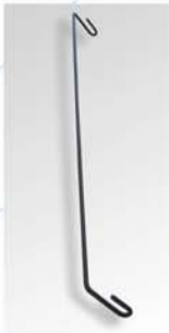
Front Product Stop

• Front Product Stop prevents spillage of product while maximising visual area.